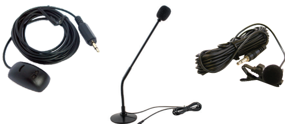
Desktop Microphone ACDTMIC